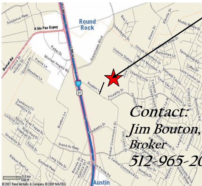
CalPly Subdivision CalPly Drive